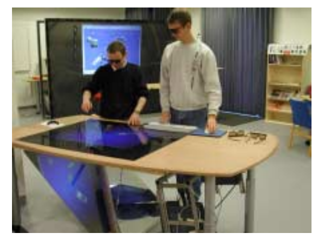
Figure 2: 3D-tables and walls supporting collaboration about documents and objects in a distributed project room

In this area CfPC is collaborating with B&O, Danfoss and Telenor about the development of "intelligent homes". The Laboratory for Interactive Workspaces undertakes research in development of furniture and rooms that support users' communication and collaboration around design documents, physical models etc. In a work context, many of these activities are related to the new EU-project WorkSPACE, which started January 1st. The result so far has been the development of a software infrastructure combining