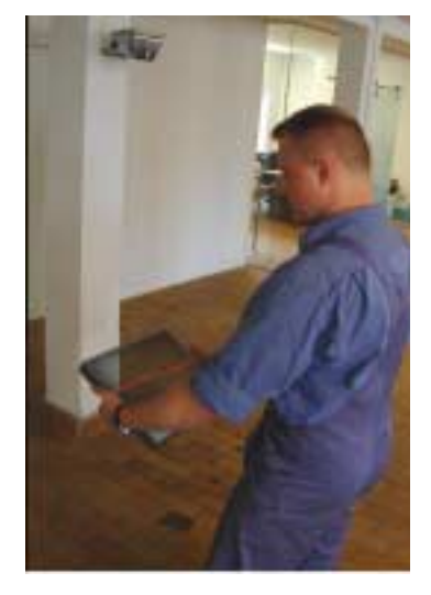
Figure 1: An electrician with a mobile device that can visualize the always-updated database over the building infrastructure, e.g. pipes and cables in the floor.

In the future, the physical infrastructure of a building, i.e. heating, ventilation, doors and access control, is controlled via a network of computers, sensors and actuators. The same network may be the carrier of control for audio and video as well as carrier of audio/video content and other data traffic, see section 3.4. The network will combine wired and wireless components. Companies like Echelon [9] and X10 [26] are marketing such