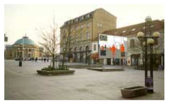
Figure 3: Projections in the city as part of the Karlskrona2 project [16].

Digital models of buildings and cities can also be used to make the living and democratic processes in cities more interactive and tangible. An example of this is the Karlskrona2 project [16], which is a digital mirror of Karlskrona aiming at creating a forum for debate among the citizens about the development of the city. The digital mirror of Karlskrona is accessible from web browsers, large projection screens and kiosks in the city. Citizens may discuss changes to the city through concrete proposals in terms of model elements entered into the digital mirror of Karlskrona. Such proposals can then be discussed via a kind of 3D chat environment. In